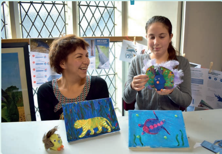
Below: Environmental Workshop