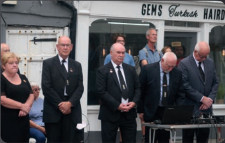
Many united to pay their respects to the departed monarch and salute their new King