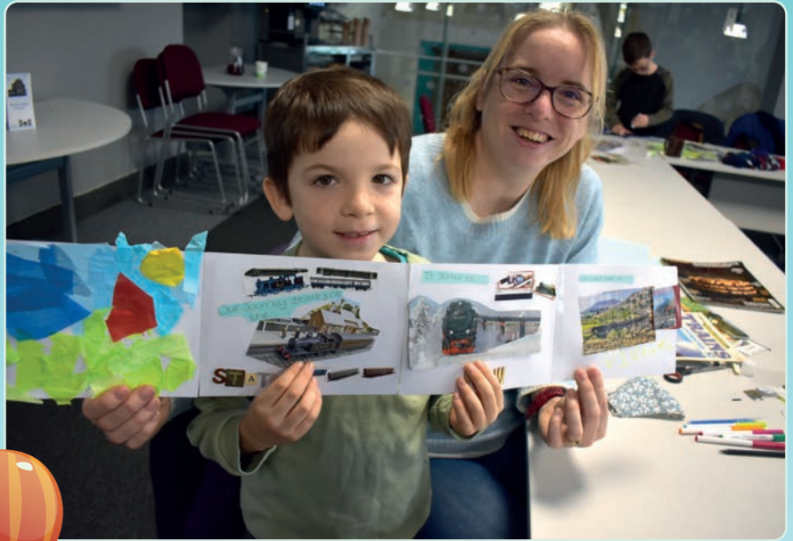
Above: Journey Book making