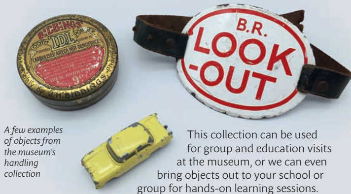
A few examples of objects from the museum's handling collection

This year has seen the introduction of a brand-new and exciting handling collection. This means that these objects can be used for education and, in many cases, can be handled by the public to inspire learning. We now have over 60 objects in this collection ranging from Victorian jewellery, a whistle used on the railway and 1960s toys to a stoneware hot water bottle and a box iron.