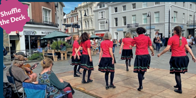
Shuffle the Deck

FOR MORE INFO: check our website: newtonabbot-tc.gov.uk