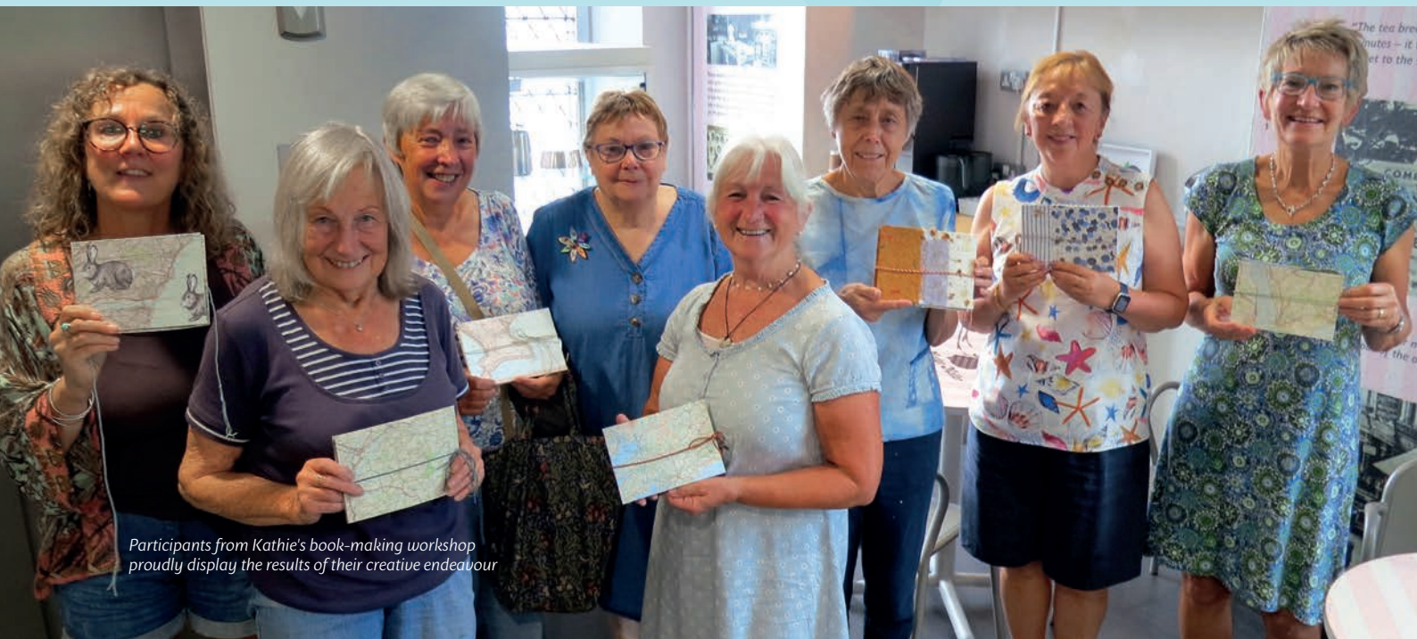
Participants from Kathie's book-making workshop proudly display the results of their creative endeavour