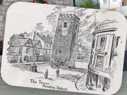
The Tower Newton Abbot.