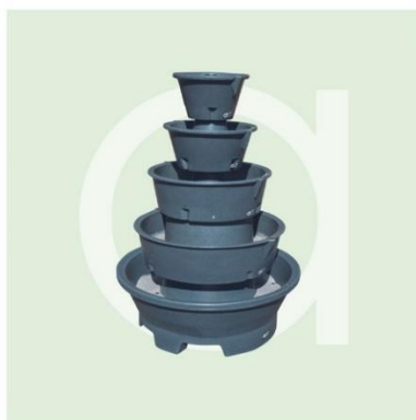
Base diameter 1400mm high x 1950mm wide