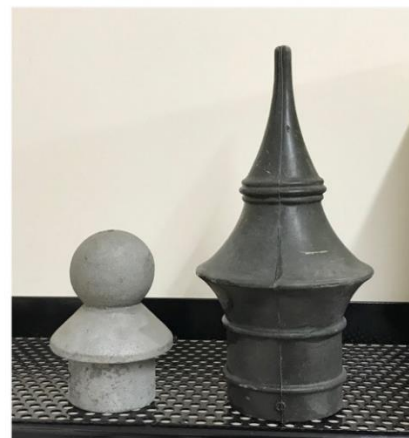
Material of finials to be polypropene resin so they are lightweight and damage proof