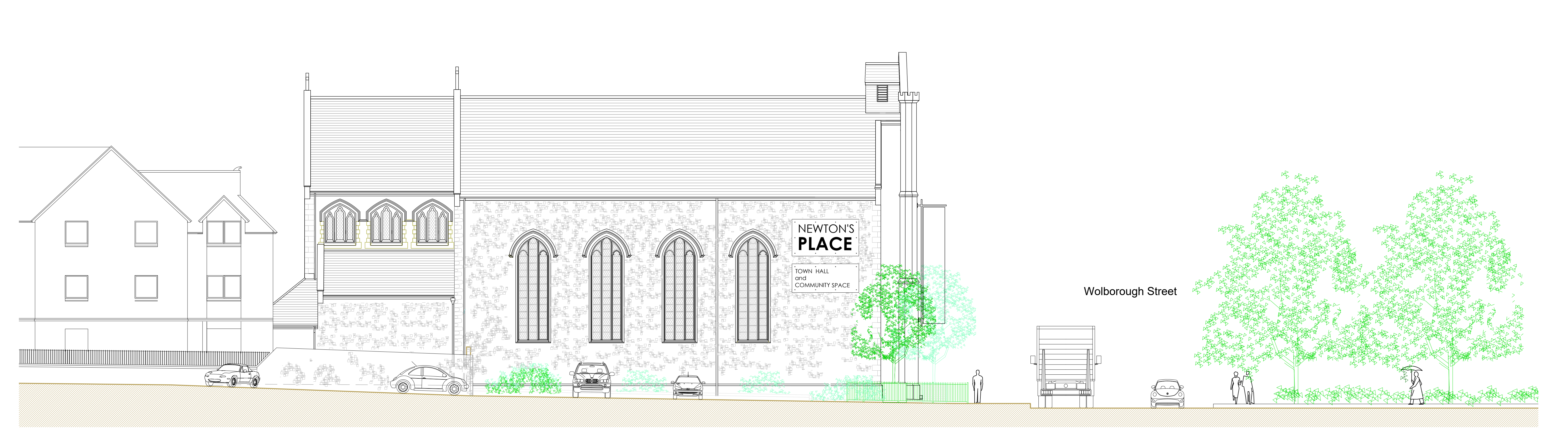
View from Newfoundland Way Car Park